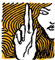
Hungarian Helsinki Committee