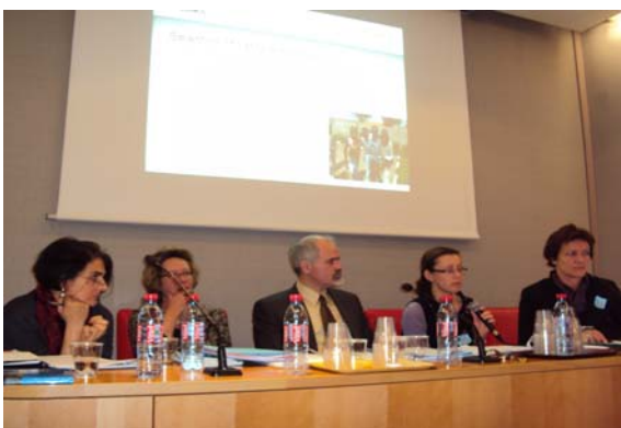
Round table in Paris: sharing civil society perspectives

And this partnership has to go further. That is why Forum réfugiés will shortly publish the first report on resettlement in France. Beside the description of the three existing "resettlement" operations in France (the annual resettlement program, the special operation for Iraqis and the relocation from Malta), the aim of this report was to identify the present difficulties of the resettlement and to propose concrete solutions for an improved resettlement in France.