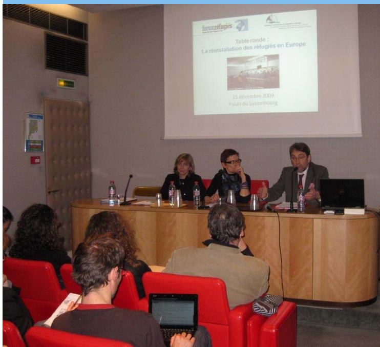
Round table with French Ministry of immigration

Round table on refugee resettlement in France: Positive political engagement has to be accompanied by improved selection process, adequate reception structures and stronger partnership with the NGOs