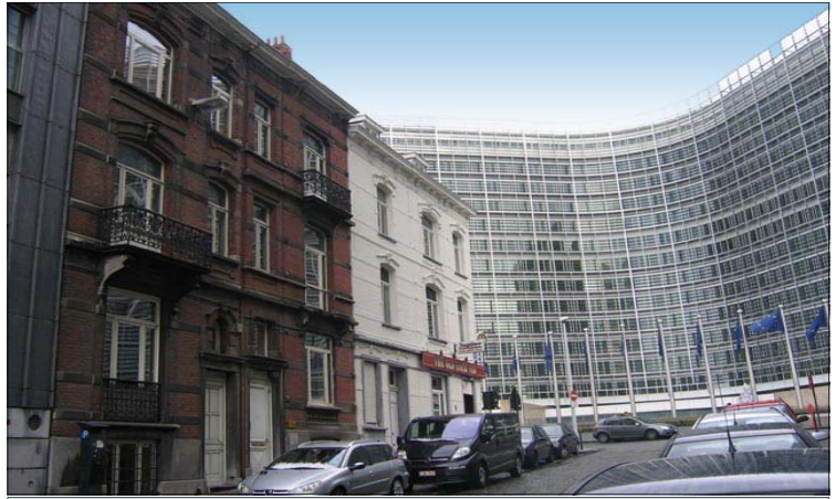
CCME office (red building on the left) in front of the European Commission Headquarters (Berlaymont)

Tel. +32 2 234 68 00; Fax +32 2 231 14 13