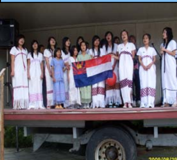
Karen refugees from Burma, in their traditional costumes, singing at the Ljusdal "World Day"