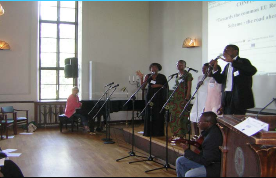
A family-choir of refugees resettled to Lulea/Sweden, at the opening plenary of the EU-wide Conference "Towards the European Resettlement Scheme", which took place in Sigtuna 25-28 August 2009

discuss the current developments regarding resettlement in Europe and deliberated on the details around an emerging European Resettlement Scheme. Regarding the information-sharing aspect of the project, the "Resettlement Newsletter" appeared five times; it was sent to some 250 persons as e-mail and/or print-out. Furthermore, around 600 copies of the existing publications on resettlement (Factsheets on resettlement) were distributed to multipliers at events and on request. Finally, the Project Steering Group, chaired by ECRE, met 3 times and evaluated the progress of the project at different stages.